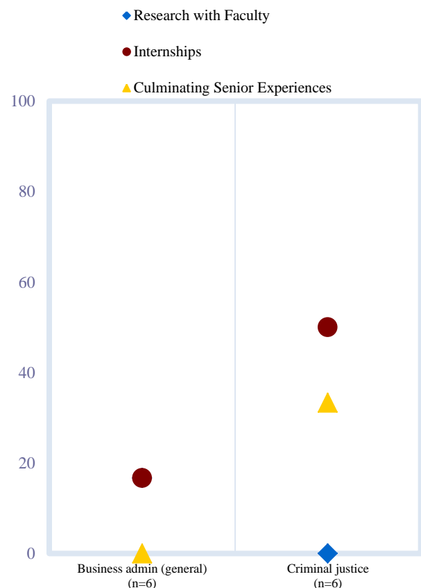
Percent of Seniors Participating in High-Impact Practices for Selected Majors b at Hilbert College

Major Field Reports which display NSSE results by eight categories of related majors – arts and humanities, biological sciences, business, education, engineering, other professions, physical sciences, and social sciences – offer another way to connect results to department level assessment and to improvements in teaching and learning. Your NSSE contact may download these reports from the Institution Interface.