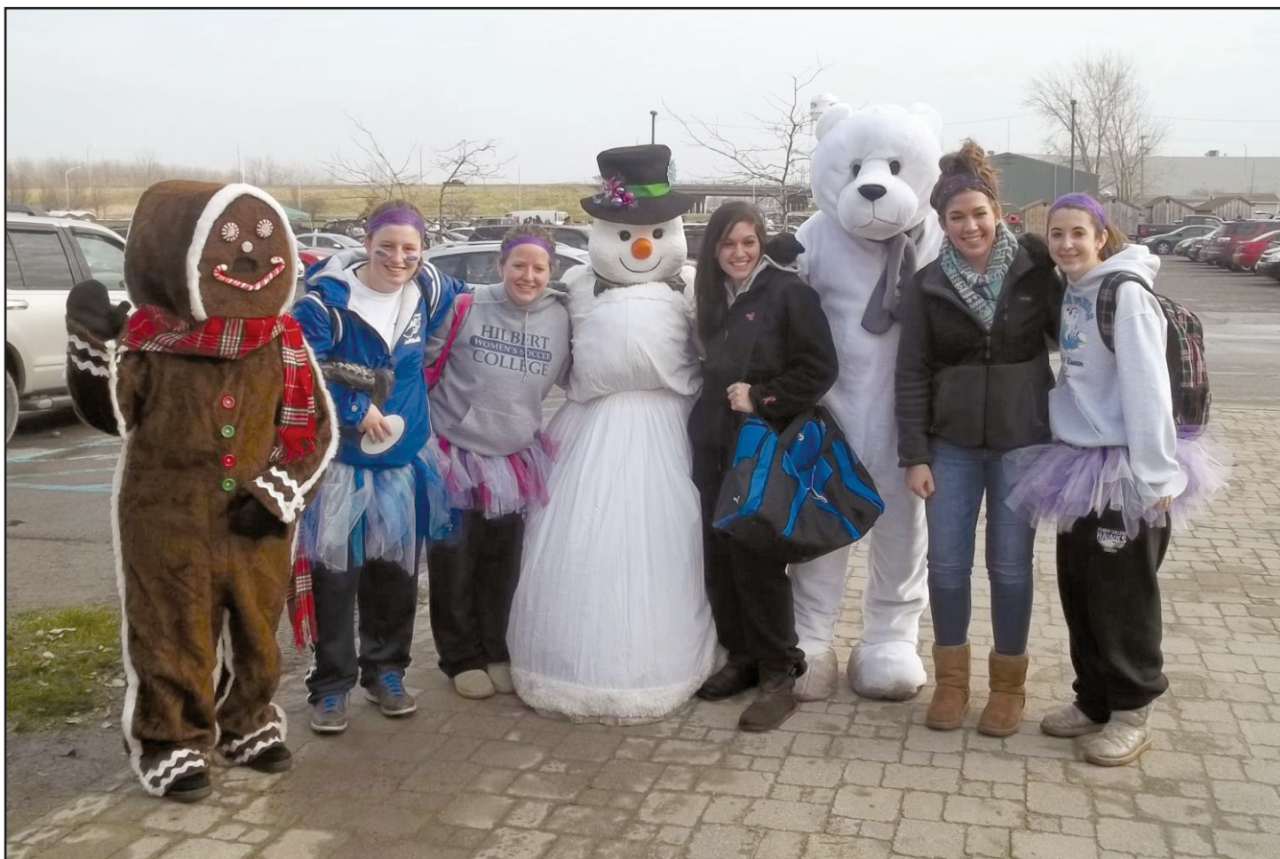
Hilbert Students Attending the Polar Plunge

The event brought out twenty student-athletes and coaches, and their efforts raised $1,000 for the New York State Special Olympics. Congratulations to those participating to raise money for this worthy cause!