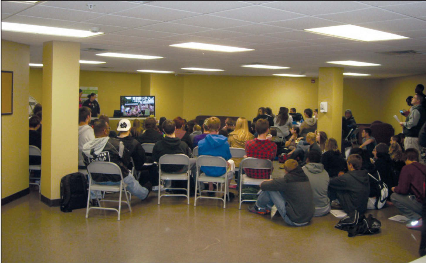
GS 101 Students Attending the Oxfam America Hunger Banquet