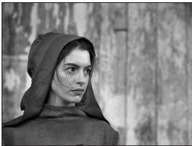
Anne Hathaway as Fantine

actors, performances, and adaptation as a whole, it will be easier if I first establish an overview of the story. The story of the film/musical/book is a very complex one, so I shall try to sum it up as briefly as possible. Jean Valjean is a Frenchman who was imprisoned for two decades for the crime of stealing bread to provide for his family. When he is released on parole, he attempts to steal silverware from a priest he encounters. Valjean is caught by the police for stealing, but he is set free by the priest, who states that he gave the silverware to him. Valjean takes this as a sign and decides to turn his life around. He finds God and